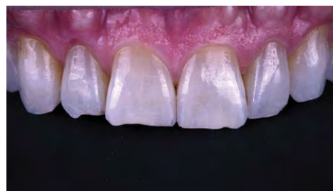
Figure 15: Preoperative retracted view.