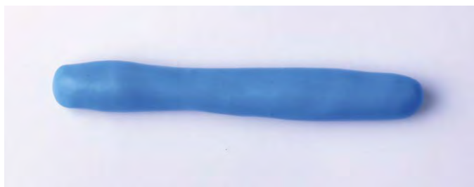
Figure 3: Cylinder shape used for preparation guide.