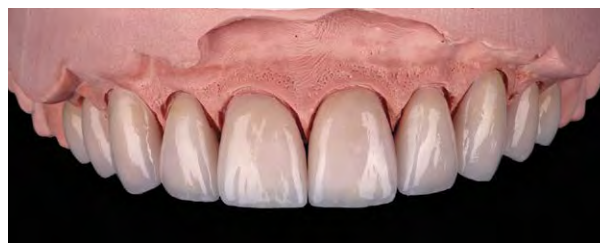
Figure 25: The definitive lithium disilicate veneers.