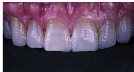
Figure 18: Initial preparation and removal of excess bis-acryl material.