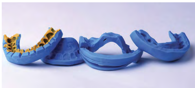
Figure 1: The four preparation guides discussed in this article.