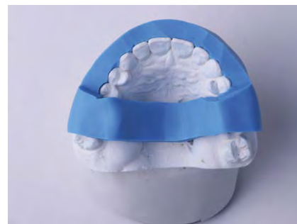
Figure 10: Contiguous matrix resulting from adaptation for facial reduction guide.