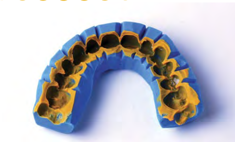
Figure 6: V-shaped vent areas to allow release of excess bis-acryl.