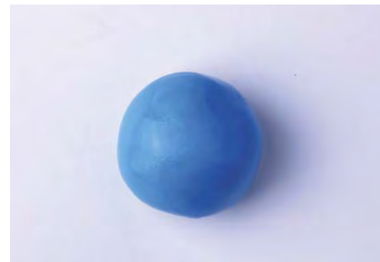
Figure 7: Sphere shape for molding putty.