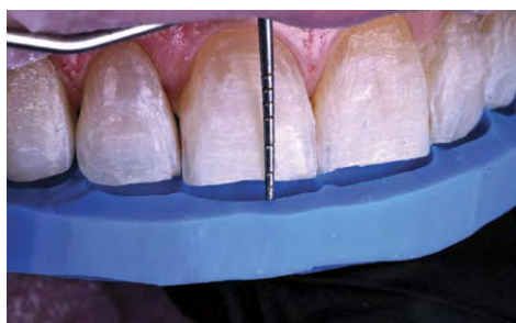
Figure 19: Incisal edge reduction guide check using a periodontal probe.