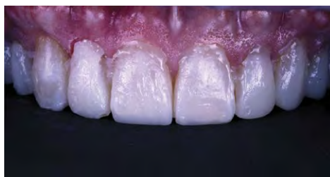
Figure 16: Bis-acryl transfer to unprepared teeth.