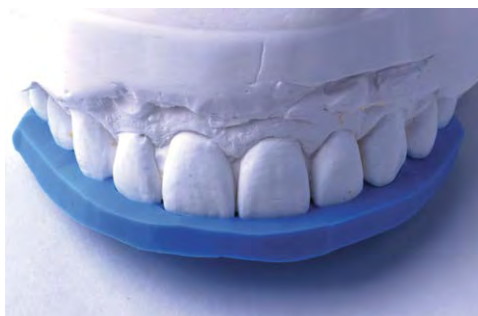
Figure 9: Small amount of overlap of the newly proposed incisal edge.