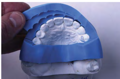
Figure 12: Occlusal view of the guide while peeling back three different planes of facial reduction.