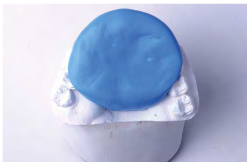
Figure 8: Adaptation of putty over incisal edges and palatal area.