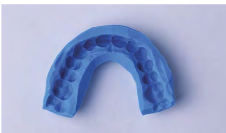
Figure 14: Facial and lingual reduction guide without PVS relining material.