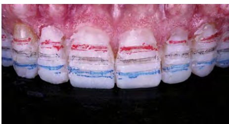
Figure 17: Depth cuts with graphite markings.