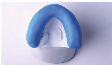
Figure 13: Adaptation for facial and lingual reduction matrix.