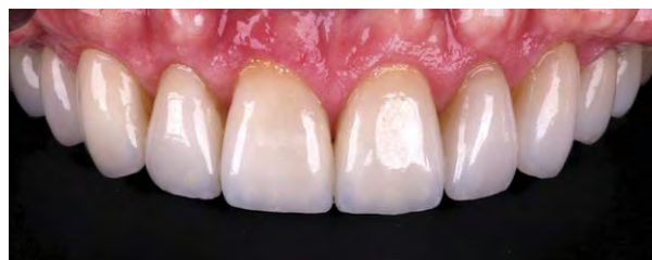
Figure 26: Retracted postoperative view.

time of 5 minutes. The provisional restorations can then be trimmed, contoured, and polished, followed by the addition of a surface glaze for enhanced esthetics (Fig 24).