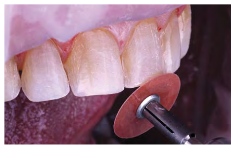
Figure 21: Beveling of the labioincisal third to ensure adequate room for incisal edge effects in the definitive restorations.