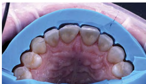
Figure 22: Facial reduction guide displaying appropriate reduction in the embrasure areas.