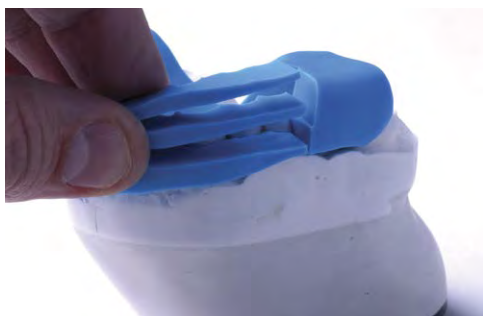
Figure 11: Three horizontal slices and one vertical releasing incision on one side only.