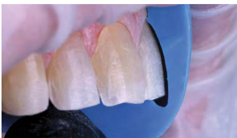
Figure 23: Facial and lingual reduction check to show smooth convex preparation with uniform reduction.