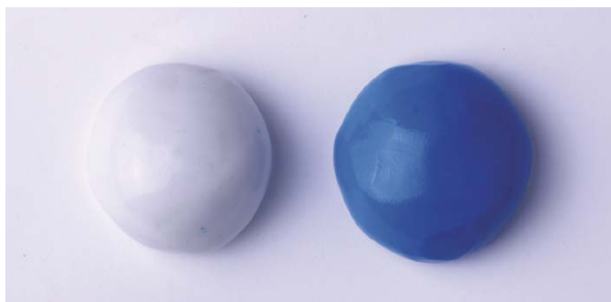
Figure 2: Equal amounts of catalyst and base putty material.