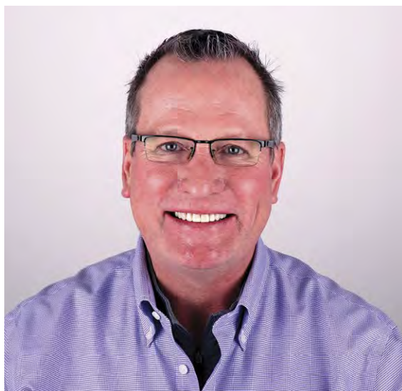
Figure 24: The approved provisional restorations.