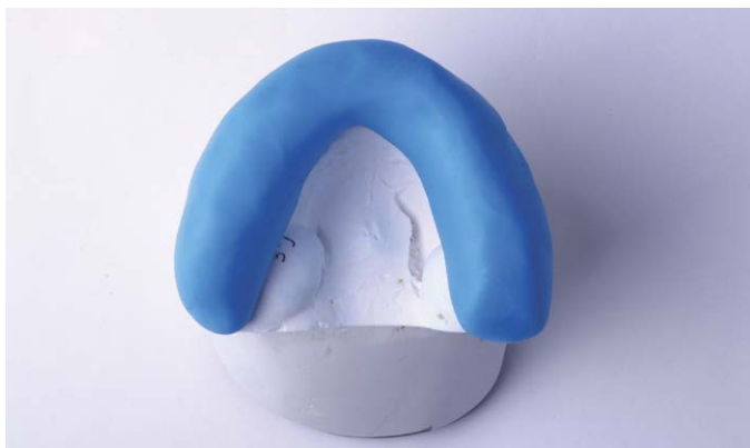
Figure 4: Adaptation of the putty over the facial, occlusal, and lingual surfaces.